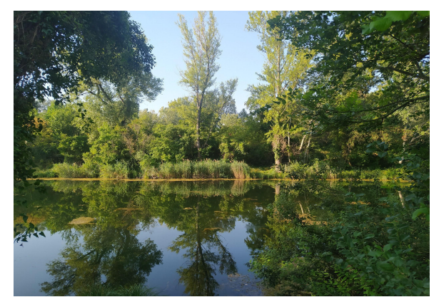
National park Lobau