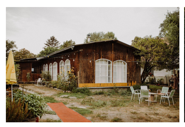
Salettl garden area